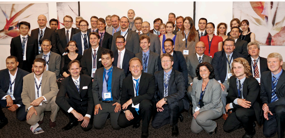
The EXTEDO team at the eRA conference in Munich

EXTEDO was founded in 2003 with a simple vision: to help life sciences organizations ensure Effortless Compliance™ with industry standards and regulatory requirements. Over the years EXTEDO has become one of the leading names in the field of Regulatory Information Management (RIM). With our EXTEDOsuite and expert consultants, we are on a mission to enable agencies, CROs and life sciences organizations around the world to bring new products to market faster and safer.